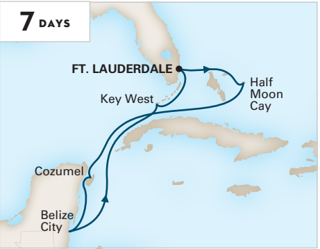
WESTERN CARIBBEAN ROUNTRIP FT. LAUDERDALE Nieuw Amsterdam 2021: Oct 23