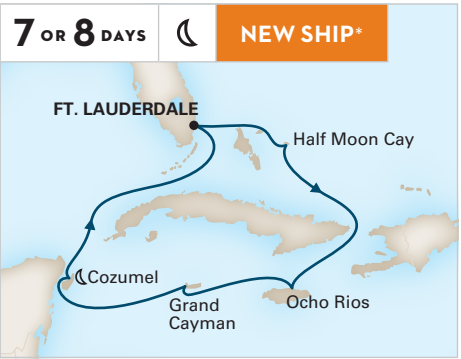
WESTERN CARIBBEAN ROUNTRIP FT. LAUDERDALE Nieuw Statendam 2021: Dec 26* Rotterdam 2022: Feb 5* Volendam 2021: Dec 15* * New ship applies to Rotterdam sailing. * Celebrate the holidays on this sailing. ♦ These itineraries are 8 days in length and vary; see hollandamerica.com for details.