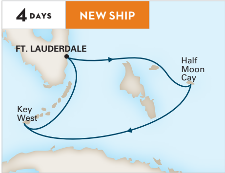
BAHAMAS & KEY WEST ROUNTRIP FT. LAUDERDALE Rotterdam 2021: Nov 3