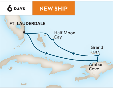
TROPICAL CARIBBEAN ROUNTRIP FT. LAUDERDALE Rotterdam 2022: Jan 23