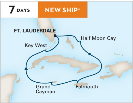
WESTERN CARIBBEAN ROUNTRIP FT. LAUDERDALE Nieuw Amsterdam 2022: Jan 8; 29*; Mar 12* Nieuw Statendam 2021: Nov 21* Rotterdam 2022: Jan 9; Feb 6; Mar 27* * New ship applies to Rotterdam sailings. ♦ These itineraries vary; see hollandamerica.com for details.