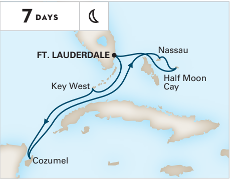
WESTERN CARIBBEAN ROUNTRIP FT. LAUDERDALE Nieuw Amsterdam 2021: Nov 6

Evening Stay. Departure between 10:00pm and Midnight. For the most up-to-date details and fares see hollandamerica.com .