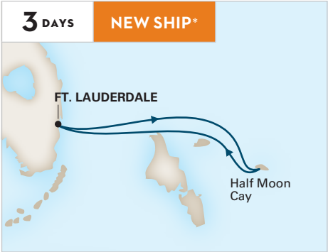
BAHAMAS ROUNTRIP FT. LAUDERDALE Eurodam 2021: Oct 31 Rotterdam 2021: Nov 7 * New ship applies to Rotterdam sailing.